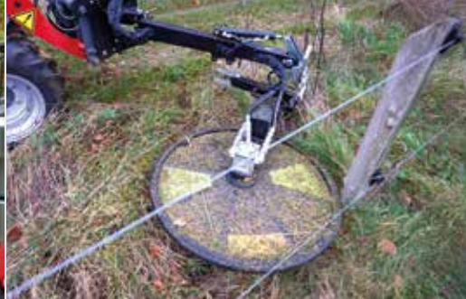
Barrier Mower RI 60 & 80