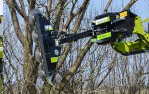
Quadsaw LRS 2002