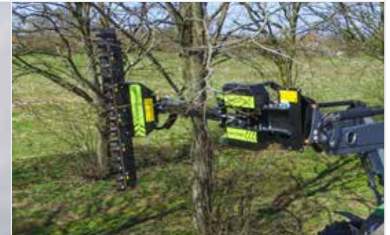
Cutterbar HX 170 - 270