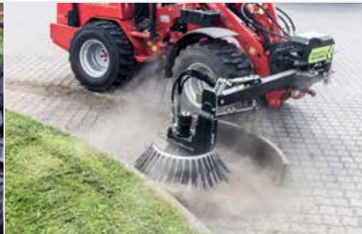
Weed Clearing Brush BR 70