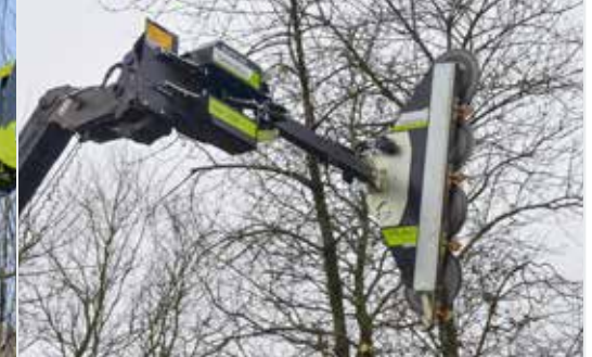
Quadsaw LRS 2402