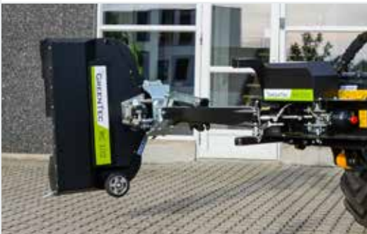
Rotary Hedge Cutter RC 102

GreenTec offers the widest selection of tools for landscape maintenance.