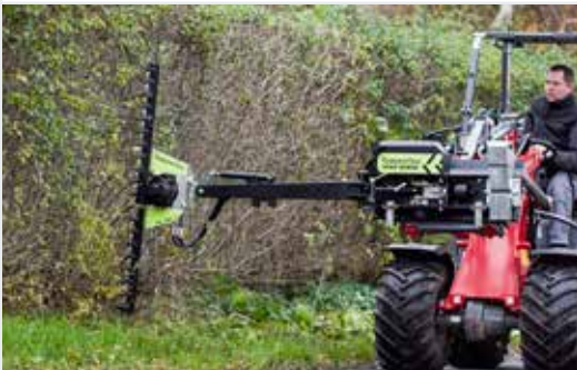
Cutterbar HL 152