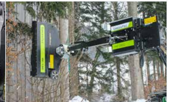
Rotary Hedge Cutter RC 132