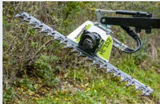
Cutterbar HL 152 - 212