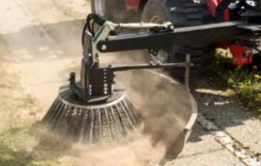
Weed Clearing Brush BR 70