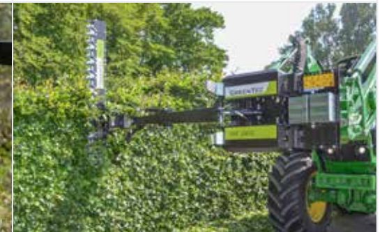
Cutterbar HS 172