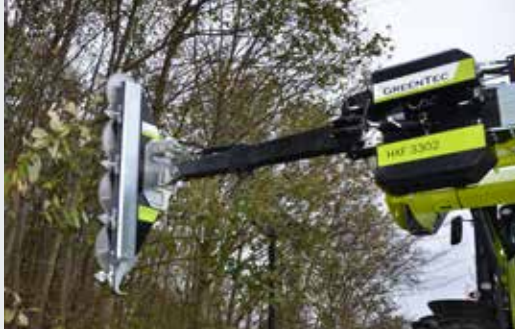
Quadsaw LRS 1602