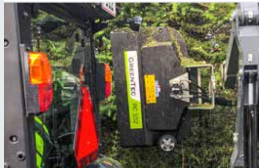
Rotary Hedge Cutter RC 102