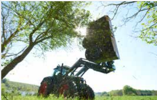
Rotary Hedge Cutter RC 132