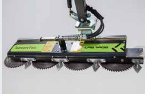
Quadsaw LRS 1402