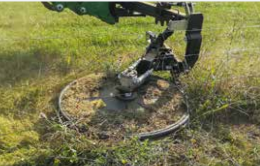
Barrier Mower RI 60 & 80