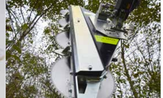
Quadsaw LRS 1602