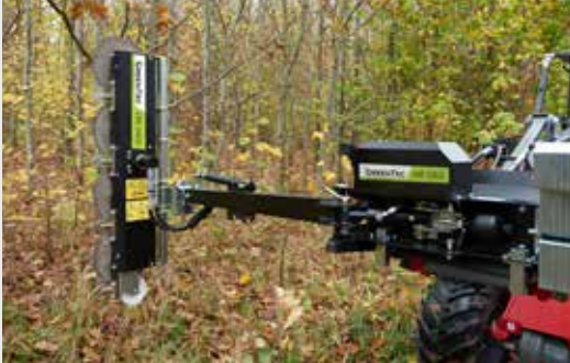
Quadsaw LRS 1402