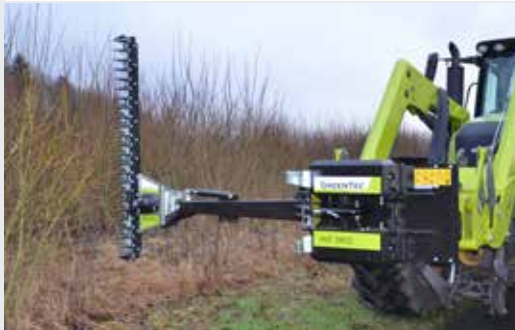
Cutterbar HL 182 & 212