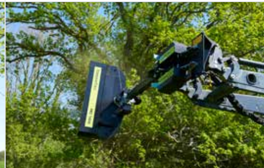
Rotary Hedge Cutter RC 162